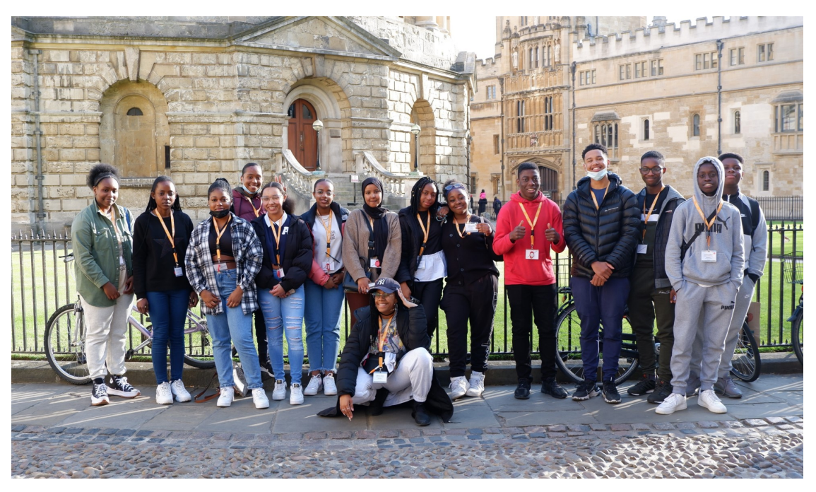
The 'EMPower Oxford' group of Year 10s who stayed with us over the vacation

Over the spring break I enjoyed leading a new course - 'Head, Hand and Hertford' for students on preparation for life, work, and citizenship. Guest speakers included a whistle blower, spy chief, Artificial Intelligence guru, bestselling author, FTSE 100 CEO, education pioneer, Britain's youngest ever black ambassador, Olympic rower and many more. Over the vacation we were also very pleased to host the first <u>EMPower Oxford residential</u> for Black Year 10s interested in engineering, materials and physics – we're looking forward to supporting this novel access programme as it continues to develop.