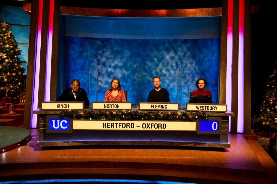
Our alumni team on Christmas University Challenge