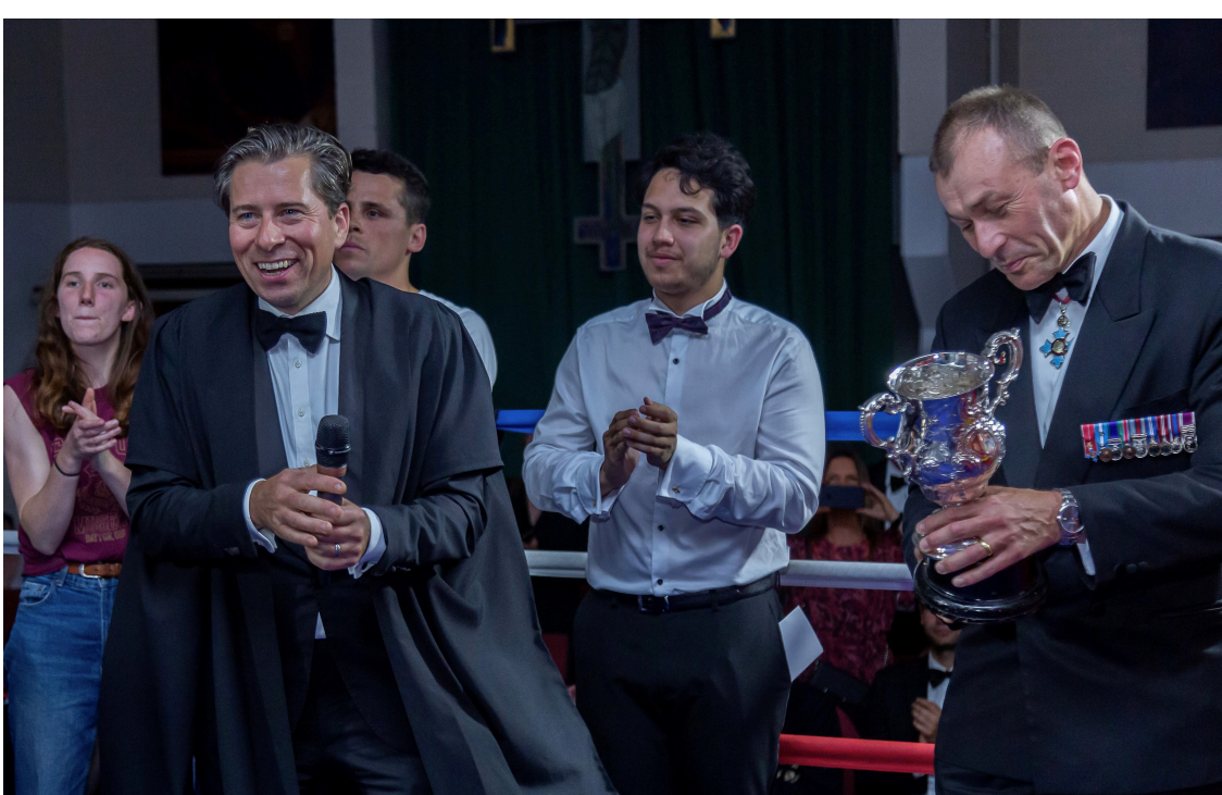
Presenting awards to Oxford and Sandhurst boxers with Sandhurst Commandant

Next year we will welcome a Ukrainian scholar and our first two Porter scholars, plus a surprise guest (and former Nobel Peace Prize winner) to take the Head, Hand and Hertford course.