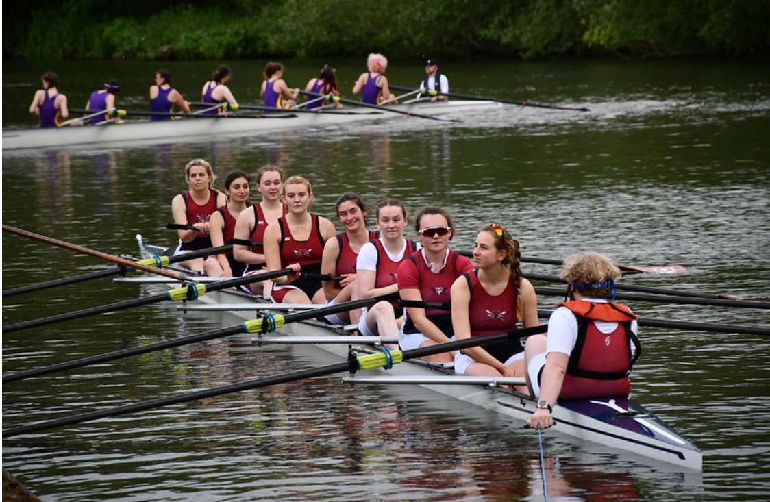
Hertford's women on the river for Summer Eights