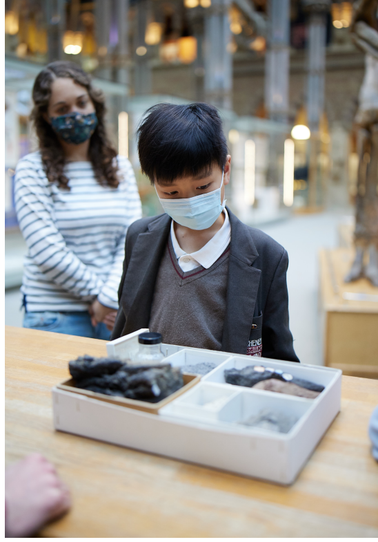
The Barton CoLab outreach group at the Museum of Natural History