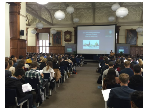
Academic Essentials presentation at Orientation

Finding your way to Oxford from the airports and Eurostar: see our guide on the orientation website (right hand menu). There is a regular public bus service that runs throughout the day and night directly from the airports to Oxford with wifi and power connection, frequent departures and on-board toilets. The guide explains how to reach Oxford and how to reach your college once you arrive in the city.