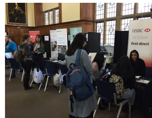
Setting up student bank accounts at Orientation