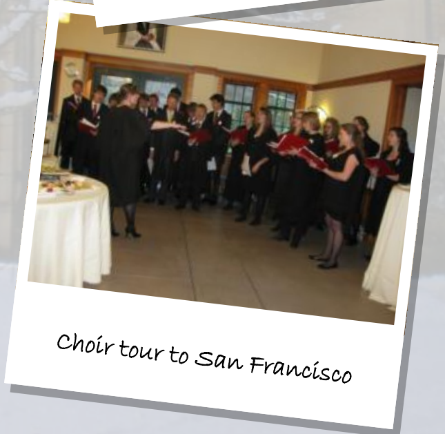
Choir tour to San Francisco

Background photo and top caption taken by Alice Thornton (History, 2008)