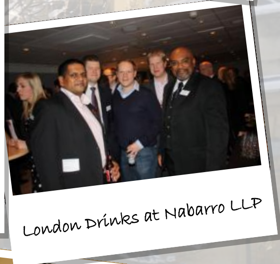
London Drinks at Nabarro LLP