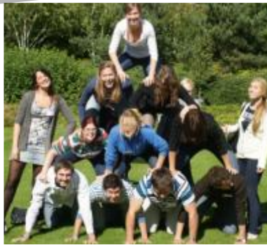
A pictorial review of the academic year so far!